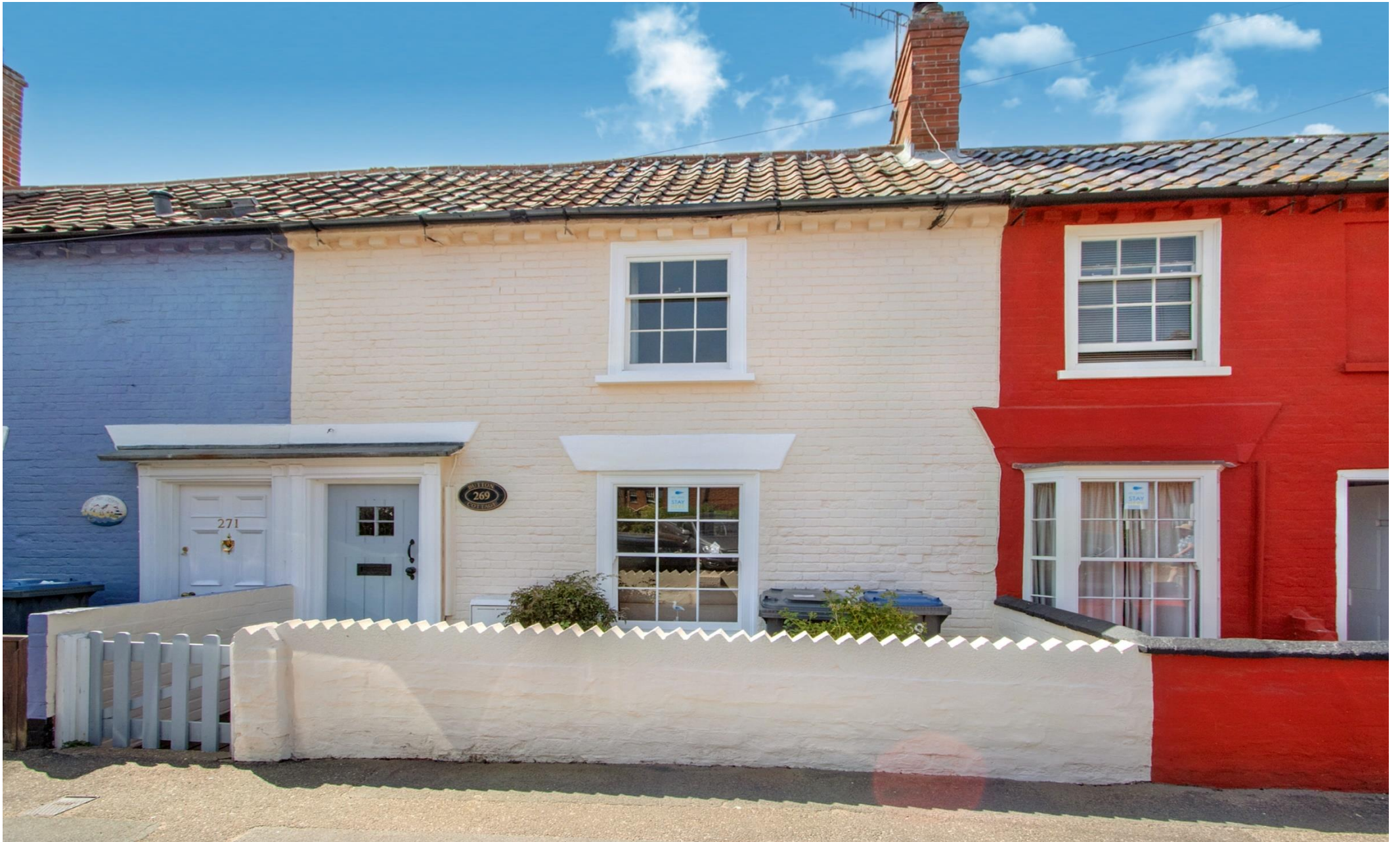
Button Cottage, Aldeburgh